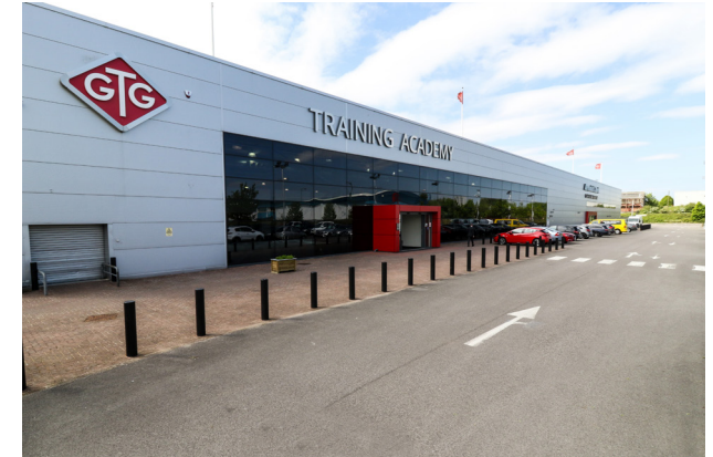
GTG West Midlands