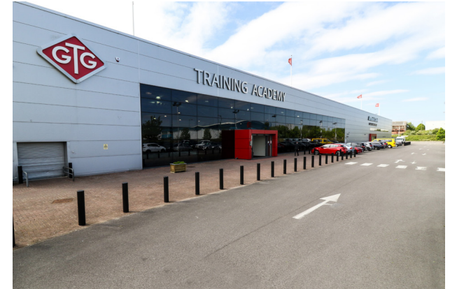
GTG West Midlands